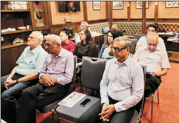
A view of members attending the meeting