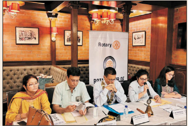
A view of Head table with AG and ZS for Zone-14